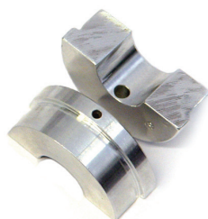
Planfix 40 collets, one set for each OD = 2 collets