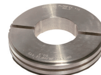
Planfix 115 collets, one set for each OD = 2 collets