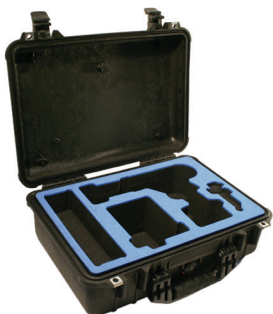
Dust- and moisture-proof transportation box with inlet for Planfix 40 and accessories.