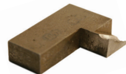
Facing tool bits (tic coated) for squaring Planfix 115