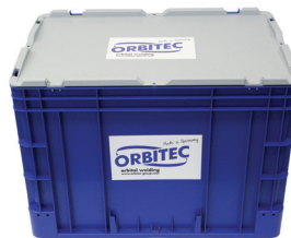
Transportation box with inlet for planfix 115 & accessories