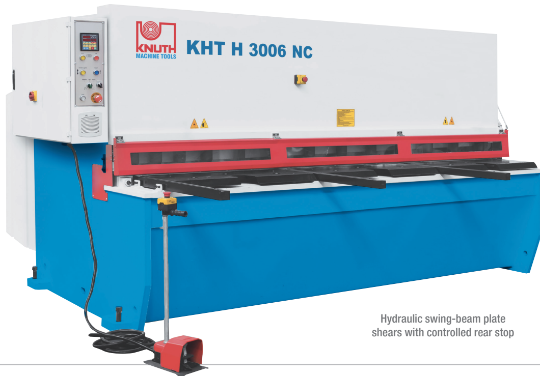
Hydraulic swing-beam plate shears with controlled rear stop