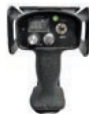
PRSHP100 Heavy rubber 25 ft. cable with 19-pin metal plug. Optional LCD readout. Wireless option available.