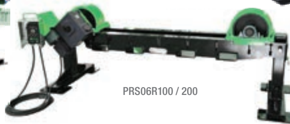
PRS06R100 / 200