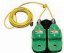
PRSF5FR Forward/Reverse Heavy-duty cast steel body with heavy-duty guard/handle and heavy rubber 25 ft. cable with 4-pin metal plug.