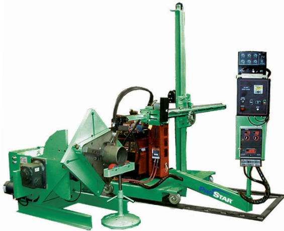
PRS Double 8

Prostar™ Manipulators Handle Small & Large Welding Jobs with Stroke to 35 Feet +