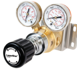
LASERSTAR K10 One Nitrogen Assist Gas Regulator Assembly

Inlet Connections 1 × CGA 320 (or 1/4 in. FNPT) 2 × CGA 580 (or 1/4 in. FNPT)