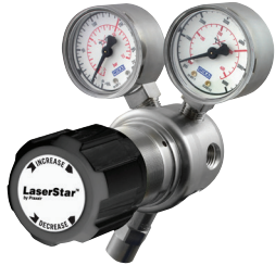
LASERSTAR™ HPS One Oxygen Assist Gas Regulator Assembly

Inlet Connection CGA 540 (or 1/4 in. FNPT)