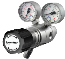
LASERSTAR HPT One to Three Resonator Gas Regulator Assemblies

Inlet Connection CGA 580 (or 1/4 in. FNPT)