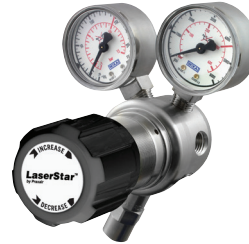
LASERSTAR HPS One Beam Purge Gas Regulator Assembly

Inlet Connection CGA 540 (or 1/4 in. FNPT)